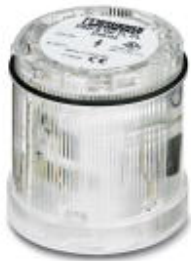
Flashing beacon element, 24 V DC, clear, Xenon flash tube

Please be informed that the data shown in this PDF Document is generated from our Online Catalog. Please find the complete data in the user's documentation. Our General Terms of Use for Downloads are valid ( http://phoenixcontact.com/download )