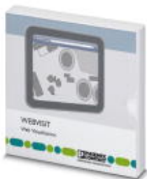
Upgrade license for upgrading from WebVisit 6 Basic to WebVisit 6 Pro

Please be informed that the data shown in this PDF Document is generated from our Online Catalog. Please find the complete data in the user's documentation. Our General Terms of Use for Downloads are valid ( http://phoenixcontact.com/download )