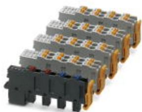
Axioline F connector set (for e.g., AXL F DI32/1 1F)

Please be informed that the data shown in this PDF Document is generated from our Online Catalog. Please find the complete data in the user's documentation. Our General Terms of Use for Downloads are valid ( http://phoenixcontact.com/download )