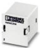
Replacement cover for slot 2 in base unit.

Covering hood - NLC-MOD-CAP-PXC - 2701292