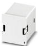
Replacement cover for slot 1 in base unit.