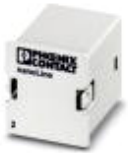
Replacement cover for slot 2 in base unit.

Covering hood - NLC-MOD-CAP-PXC - 2701292