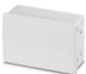
Replacement cover for base unit