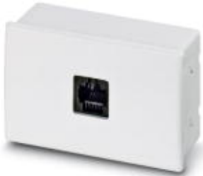
Panel to mount in base unit, RJ-45 connector for remote Operator Panel

Please be informed that the data shown in this PDF Document is generated from our Online Catalog. Please find the complete data in the user's documentation. Our General Terms of Use for Downloads are valid ( http://phoenixcontact.com/download )