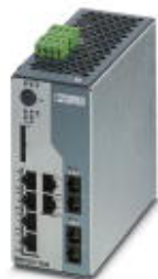
Managed Switch 7000, 6 RJ45 ports 10/100 Mbps, 2 SC multi-mode 100 Mbps, degree of protection: IP20, EtherNet/IP™

Please be informed that the data shown in this PDF Document is generated from our Online Catalog. Please find the complete data in the user's documentation. Our General Terms of Use for Downloads are valid ( http://phoenixcontact.com/download )