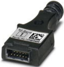
Radioline - configuration stick for easy and safe network addressing for the 900 MHz wireless module (RAD-900-...), unique network ID, RF band 1

Please be informed that the data shown in this PDF Document is generated from our Online Catalog. Please find the complete data in the user's documentation. Our General Terms of Use for Downloads are valid ( http://phoenixcontact.com/download )