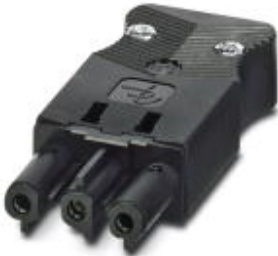
Socket for power supply and series connection, black, 3-pos.

Please be informed that the data shown in this PDF Document is generated from our Online Catalog. Please find the complete data in the user's documentation. Our General Terms of Use for Downloads are valid ( http://phoenixcontact.com/download )