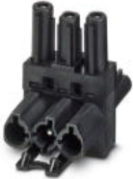
T-distributor with 2 sockets and one connector for series connection, black, 3-pos.

Please be informed that the data shown in this PDF Document is generated from our Online Catalog. Please find the complete data in the user's documentation. Our General Terms of Use for Downloads are valid ( http://phoenixcontact.com/download )