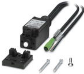
Door position switch with 3 m cable with open cable end and 0.6 m cable with M8 socket (Snap-in), including mounting accessories

Please be informed that the data shown in this PDF Document is generated from our Online Catalog. Please find the complete data in the user's documentation. Our General Terms of Use for Downloads are valid ( http://phoenixcontact.com/download )