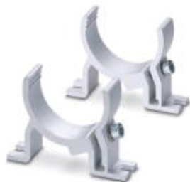
Mounting holder, AlMgSi0,5: Aluminum, for machine lights PLD M 260 .../D40, Swiveling range \pm 20^\circ

Please be informed that the data shown in this PDF Document is generated from our Online Catalog. Please find the complete data in the user's documentation. Our General Terms of Use for Downloads are valid ( http://phoenixcontact.com/download )