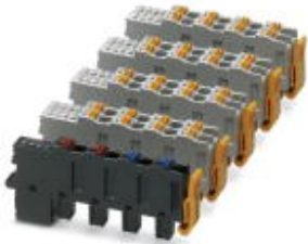
Axioline F plug set (for e.g., AXL F DI32/1 2H)

Please be informed that the data shown in this PDF Document is generated from our Online Catalog. Please find the complete data in the user's documentation. Our General Terms of Use for Downloads are valid ( http://phoenixcontact.com/download )