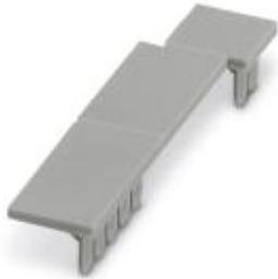
Terminal cover, 1 strip covers up to 12 terminal points, for ME-BUS terminal opening, (male side)

Please be informed that the data shown in this PDF Document is generated from our Online Catalog. Please find the complete data in the user's documentation. Our General Terms of Use for Downloads are valid ( http://phoenixcontact.com/download )