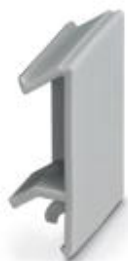
Filler plug for unoccupied terminal points, color: Light gray

Please be informed that the data shown in this PDF Document is generated from our Online Catalog. Please find the complete data in the user's documentation. Our General Terms of Use for Downloads are valid ( http://phoenixcontact.com/download )