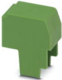
Filler plugs, for unoccupied terminal points

Please be informed that the data shown in this PDF Document is generated from our Online Catalog. Please find the complete data in the user's documentation. Our General Terms of Use for Downloads are valid ( http://phoenixcontact.com/download )