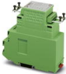
Replacement remote bus connector set, for INTERBUS-ST bus terminal block BKM-...

Please be informed that the data shown in this PDF Document is generated from our Online Catalog. Please find the complete data in the user's documentation. Our General Terms of Use for Downloads are valid ( http://phoenixcontact.com/download )