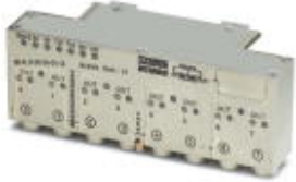
The illustration shows version IBS RL 24 DO 8/8-2A-LK-2MBD

Digital output device for INTERBUS; twisted pair with 500 kbaud, 8 outputs (24 V DC, 2 A), actuator connection via 5-pos. M12 female connectors, rugged metal housing, IP67 protection