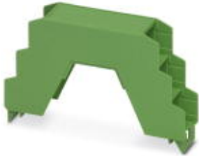
Upper part of housing, for COMBICON connection, three-level

Please be informed that the data shown in this PDF Document is generated from our Online Catalog. Please find the complete data in the user's documentation. Our General Terms of Use for Downloads are valid ( http://download.phoenixcontact.com )