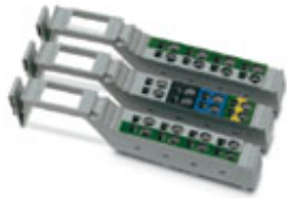
Connector set, for Inline input terminal blocks with AC voltage

Please be informed that the data shown in this PDF Document is generated from our Online Catalog. Please find the complete data in the user's documentation. Our General Terms of Use for Downloads are valid ( http://phoenixcontact.com/download )