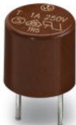
Replacement fuse, for INTERBUS-ST modules

Please be informed that the data shown in this PDF Document is generated from our Online Catalog. Please find the complete data in the user's documentation. Our General Terms of Use for Downloads are valid ( http://phoenixcontact.com/download )