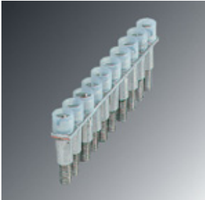
Fixed bridge, pitch: 5 mm, number of positions: 10, color: silver

Please be informed that the data shown in this PDF Document is generated from our Online Catalog. Please find the complete data in the user's documentation. Our General Terms of Use for Downloads are valid ( http://phoenixcontact.com/download )