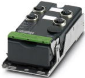
AS-i digital output module, single slave, 4 digital outputs, 24 V DC, IP67 protection

Please be informed that the data shown in this PDF Document is generated from our Online Catalog. Please find the complete data in the user's documentation. Our General Terms of Use for Downloads are valid ( http://phoenixcontact.com/download )