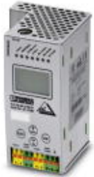
AS-Interface (AS-i)-Gateway for PROFIBUS DP with extended function, double master, IP20 degree of protection, as per AS-i specification 3.0

Please be informed that the data shown in this PDF Document is generated from our Online Catalog. Please find the complete data in the user's documentation. Our General Terms of Use for Downloads are valid ( http://phoenixcontact.com/download )