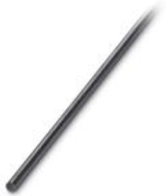
Return busbar, color: silver

Please be informed that the data shown in this PDF Document is generated from our Online Catalog. Please find the complete data in the user's documentation. Our General Terms of Use for Downloads are valid ( http://phoenixcontact.com/download )