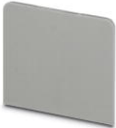
Separating plate, width: 0.5 mm, color: gray

Please be informed that the data shown in this PDF Document is generated from our Online Catalog. Please find the complete data in the user's documentation. Our General Terms of Use for Downloads are valid ( http://phoenixcontact.com/download )