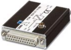
Interface converter, for converting RS-232 (V.24) to RS-422 (V.11), with galvanic isolation

Please be informed that the data shown in this PDF Document is generated from our Online Catalog. Please find the complete data in the user's documentation. Our General Terms of Use for Downloads are valid ( http://phoenixcontact.com/download )