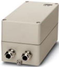
Housing for mounting surge voltage arresters

Please be informed that the data shown in this PDF Document is generated from our Online Catalog. Please find the complete data in the user's documentation. Our General Terms of Use for Downloads are valid ( http://phoenixcontact.com/download )