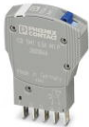
Thermomagnetic device circuit breaker, 1-pos., tripping characteristic M1 (medium-blow), 1 PDT contact, plug for base element.

Please be informed that the data shown in this PDF Document is generated from our Online Catalog. Please find the complete data in the user's documentation. Our General Terms of Use for Downloads are valid ( http://download.phoenixcontact.com )