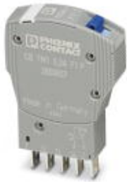
Thermomagnetic device circuit breaker, 1-pos., tripping characteristic F1 (fast-blow), 1 PDT contact, plug for base element.

Please be informed that the data shown in this PDF Document is generated from our Online Catalog. Please find the complete data in the user's documentation. Our General Terms of Use for Downloads are valid ( http://download.phoenixcontact.com )