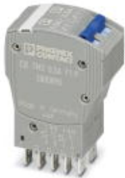
Thermomagnetic device circuit breaker, 2-pos., tripping characteristic F1 (fast-blow), 2 PDT contacts, plug for base element.

Please be informed that the data shown in this PDF Document is generated from our Online Catalog. Please find the complete data in the user's documentation. Our General Terms of Use for Downloads are valid ( http://download.phoenixcontact.com )