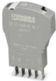
Electronic device circuit breaker, 1-pos., active current limitation, 1 N/O contact, plug for base element.

Please be informed that the data shown in this PDF Document is generated from our Online Catalog. Please find the complete data in the user's documentation. Our General Terms of Use for Downloads are valid ( http://download.phoenixcontact.com )