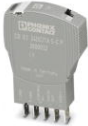
Electronic device circuit breaker, 1-pos., active current limitation, status output and control input, plug for base element.

Please be informed that the data shown in this PDF Document is generated from our Online Catalog. Please find the complete data in the user's documentation. Our General Terms of Use for Downloads are valid ( http://download.phoenixcontact.com )