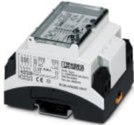
Differential current monitor in type A version for detecting pulsing AC and DC leakage currents at 50/60 Hz.

Please be informed that the data shown in this PDF Document is generated from our Online Catalog. Please find the complete data in the user's documentation. Our General Terms of Use for Downloads are valid ( http://phoenixcontact.com/download )