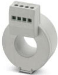
Differential current converter for type A differential current monitor.

Please be informed that the data shown in this PDF Document is generated from our Online Catalog. Please find the complete data in the user's documentation. Our General Terms of Use for Downloads are valid ( http://phoenixcontact.com/download )