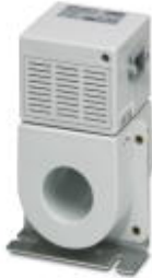
Residual current converter for type B+ residual current monitor.

Please be informed that the data shown in this PDF Document is generated from our Online Catalog. Please find the complete data in the user's documentation. Our General Terms of Use for Downloads are valid ( http://phoenixcontact.com/download )