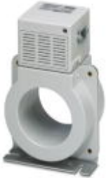
Residual current converter for type B+ residual current monitor.

Please be informed that the data shown in this PDF Document is generated from our Online Catalog. Please find the complete data in the user's documentation. Our General Terms of Use for Downloads are valid ( http://phoenixcontact.com/download )