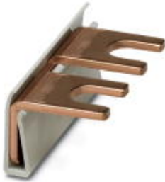
Wiring bridge for modules with connecting pitch 17.5 mm, 1-phase, 2-pos.

Please be informed that the data shown in this PDF Document is generated from our Online Catalog. Please find the complete data in the user's documentation. Our General Terms of Use for Downloads are valid ( http://download.phoenixcontact.com )