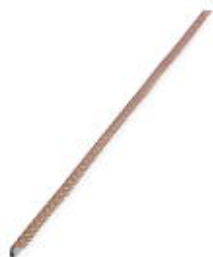
Wiring bridge for modules with connecting pitch 17.5 mm, 1-phase, 57-pos.

Please be informed that the data shown in this PDF Document is generated from our Online Catalog. Please find the complete data in the user's documentation. Our General Terms of Use for Downloads are valid ( http://phoenixcontact.com/download )