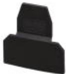
End cover, Length: 56 mm, Width: 2.5 mm, Height: 66.5 mm, Color: black