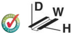
The illustration shows version MCR-PT100-I-DC

Pt 100 temperature transducer, configurable via DIP switch, selection between 2, 3, 4-conductor technology; input: 0...100 °C, 0...150 °C, 0...200 °C, 0...300 °C, -50...+50 °C, -50...100 °C, -50...150 °C, -50...250 °C, output signal 0...10 V