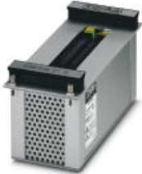
Test adapter for COMTRAB CT 10

Please be informed that the data shown in this PDF Document is generated from our Online Catalog. Please find the complete data in the user's documentation. Our General Terms of Use for Downloads are valid ( http://download.phoenixcontact.com )