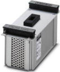
Test adapter for COMTRAB-CTM

Please be informed that the data shown in this PDF Document is generated from our Online Catalog. Please find the complete data in the user's documentation. Our General Terms of Use for Downloads are valid ( http://download.phoenixcontact.com )