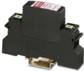
Protective plug UFBK-M with two conductor protection in floating signal circuits. Nominal voltage: 24 V DC

Please be informed that the data shown in this PDF Document is generated from our Online Catalog. Please find the complete data in the user's documentation. Our General Terms of Use for Downloads are valid ( http://download.phoenixcontact.com )