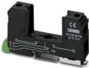
Base element for type 2 arresters of the VALVETRAB MS series of products, with remote indication contact. Design: 1-channel

Please be informed that the data shown in this PDF Document is generated from our Online Catalog. Please find the complete data in the user's documentation. Our General Terms of Use for Downloads are valid ( http://download.phoenixcontact.com )