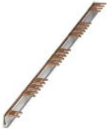
Wiring bridge for modules with connecting pitch 17.5 mm, 1-phase, 20 pitches with contact sequence 1-2-0-0-5

Please be informed that the data shown in this PDF Document is generated from our Online Catalog. Please find the complete data in the user's documentation. Our General Terms of Use for Downloads are valid ( http://phoenixcontact.com/download )