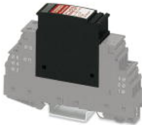
Type 3 arrester replacement connector (device protection) for 1-phase power supply networks with separate N and PE (3-conductor system: L1, N, PE).

Please be informed that the data shown in this PDF Document is generated from our Online Catalog. Please find the complete data in the user's documentation. Our General Terms of Use for Downloads are valid ( http://download.phoenixcontact.com )