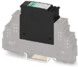
Protective plug PT with HF protective circuit for two 2-core floating signal circuits. Nominal voltage: 5 V DC

Please be informed that the data shown in this PDF Document is generated from our Online Catalog. Please find the complete data in the user's documentation. Our General Terms of Use for Downloads are valid ( http://download.phoenixcontact.com )