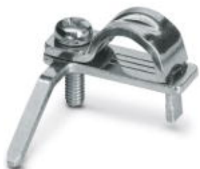
Shield connection clip for printed circuit terminal block

Please be informed that the data shown in this PDF Document is generated from our Online Catalog. Please find the complete data in the user's documentation. Our General Terms of Use for Downloads are valid ( http://phoenixcontact.com/download )